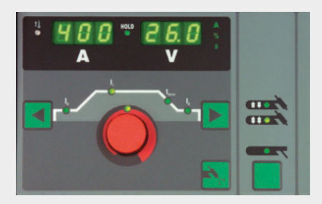
/ TransTig control panel