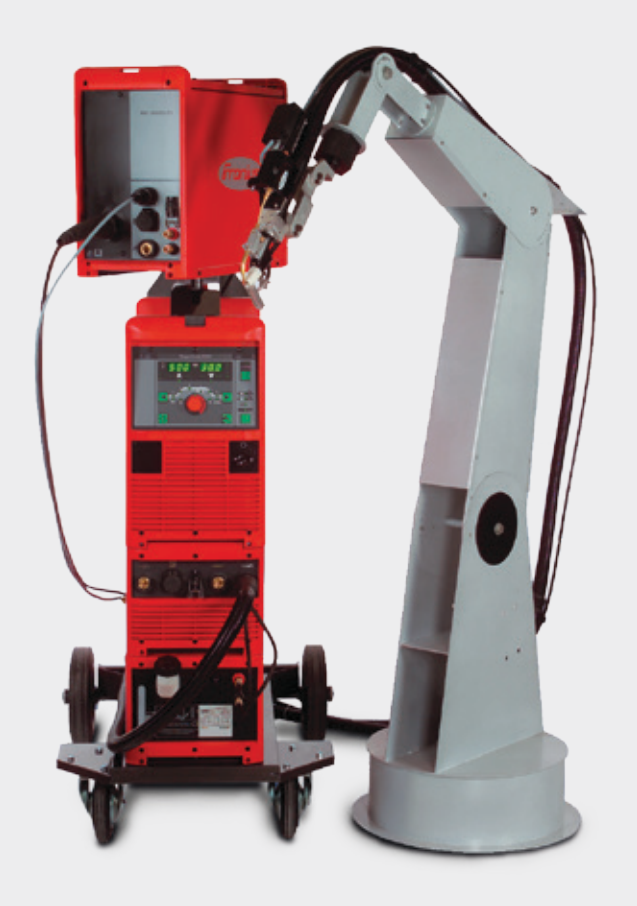
/ MagicWave 5000 and Robacta TTW 4500 robot welding torch with Robacta KD-Drive cold-wire feeder unit

ferent control panels for this series of machines: Standard or Job. The "Job" control panel offers additional functions such as job mode, and enables cold-wire control and automated applications.