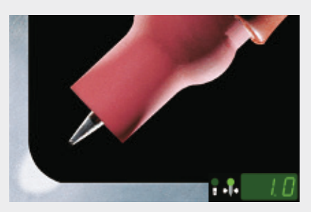
Cap diameter: 1 mm Base metal: AIMg3 Sheet thickness: 5 mm Welding amperage: 185 A Welding voltage: 15.6 V AC Balance: -5

/ The cap is shaped automatically, by the way, which means huge time-savings. All you need to do is clamp the pointed electrode into the electrode holder and preselect the cap diameter, and the arc then immediately forms the shape and size of cap that you want. Another interesting function enables you to make variable adjustments to the AC waveform, giving the welder reliable weld-pool control even at high amperages.