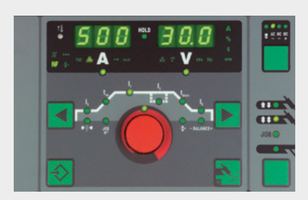
/ MagicWave "Job" control panel

/ Even welding systems with very wide-ranging functionality ought to be easy to operate. And it is just this which is yet another big strength of the Fronius systems. The extensive know-how stored in the systems can be intuitively retrieved, and the control panels are self-explanatory and straightforward. What is more, there is a choice of two dif-