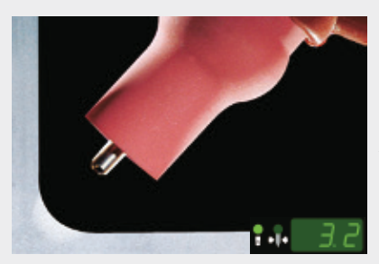
Cap diameter: 3.2 mm Base metal: AIMg3 Sheet thickness: 5 mm Welding amperage: 185 A Welding voltage: 15.6 V AC Balance: 0